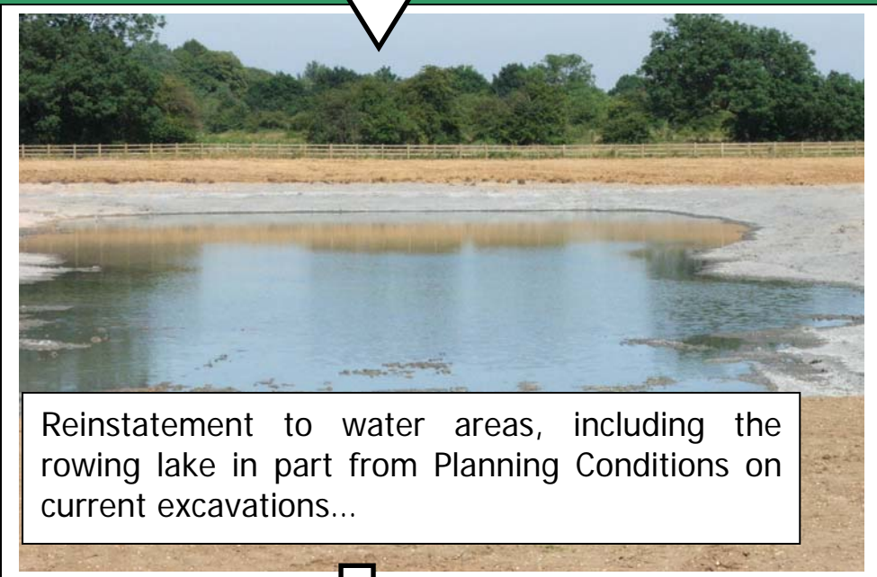
Reinstatement to water areas, including the rowing lake in part from Planning Conditions on current excavations...