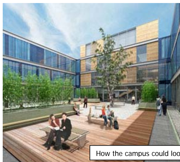
How the campus could look